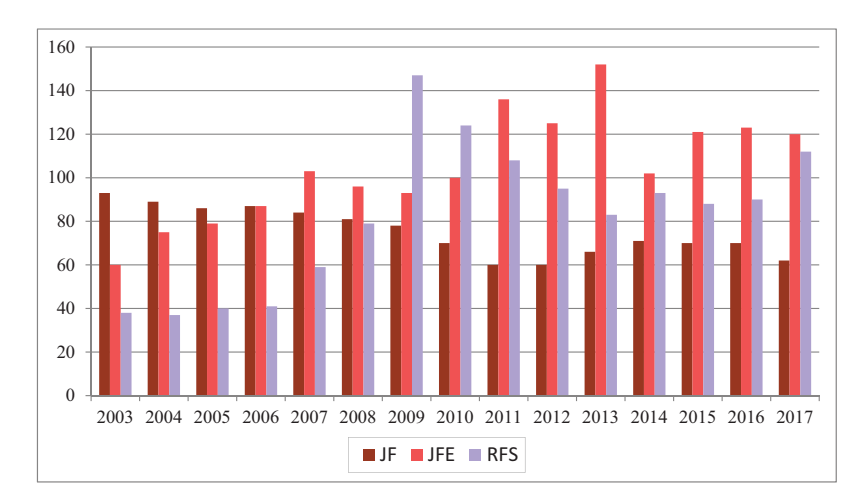
Figure 3. Total publications of top three finance journals. (Color figure can be viewed at wileyonlinelibrary.com)

institution (where an article with n authors is counted as 1/n articles for each author's institution). The institutions with the most Journal authors in 2017 were Yale University, Stanford University, and The Ohio State University.